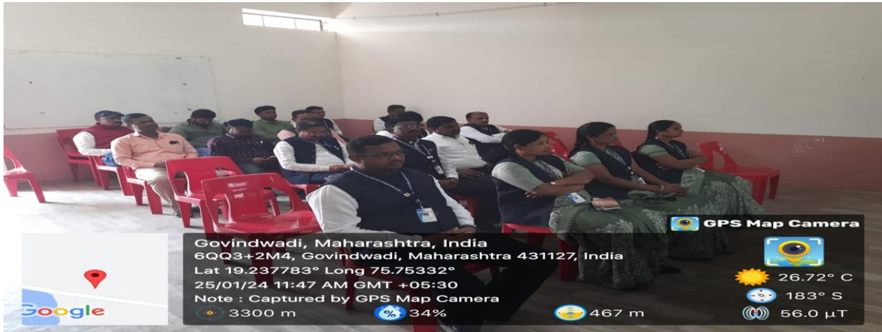
Participated in Votes day Celebration On 25/01/2024