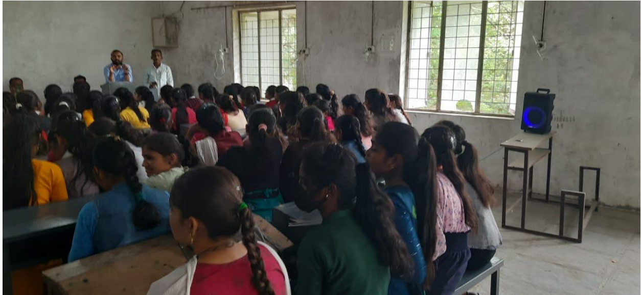
Participated Students in Voter Registration Awareness Workshop on 23/09/2023