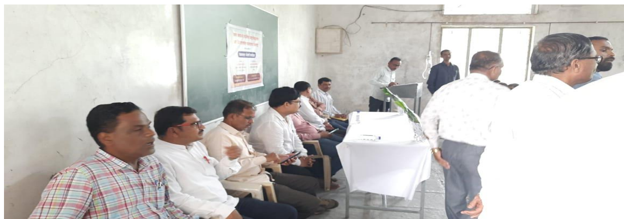
Hon. Tahsildar Chief guest on 23/09/2023